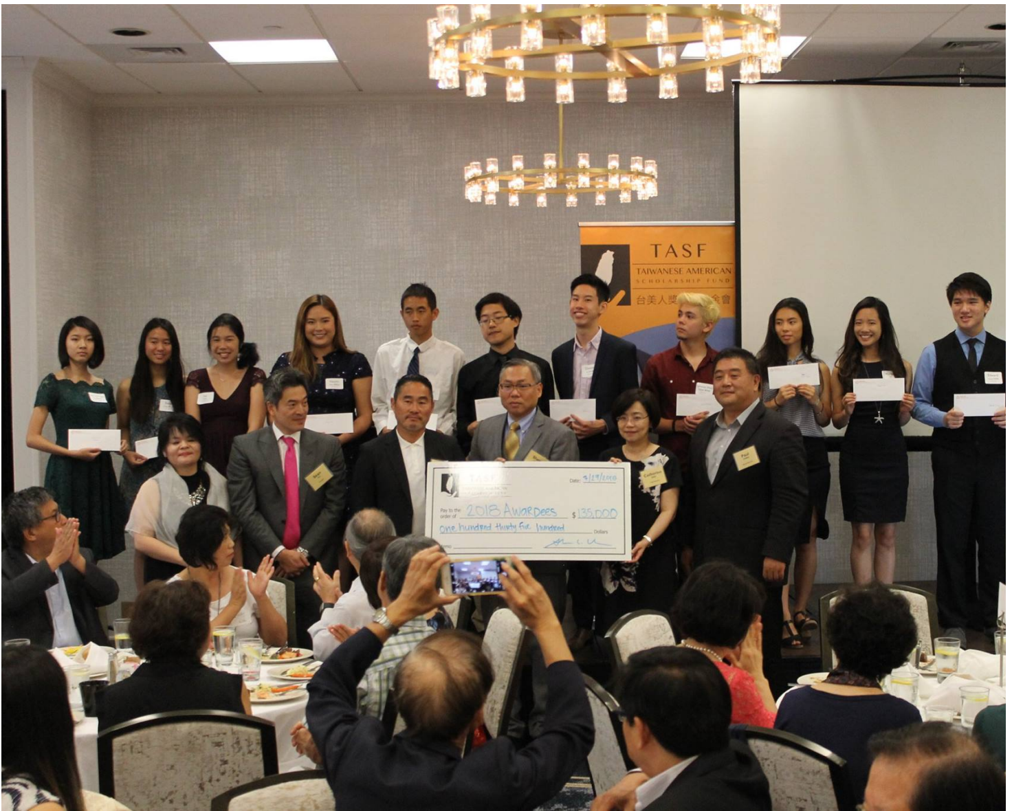
Scholarship winners at the TASF 2018 Awards Luncheon.

The Taiwanese American Scholarship Fund (TASF), the Cathay Bank Foundation, Royal Business Bank are offering scholarships for the fall of 2019. The deadline to apply for all scholarships listed here is Wednesday, September 12, 2018 at 11:59 p.m.