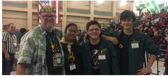
MHS Robotics Teams Advance to Regionals