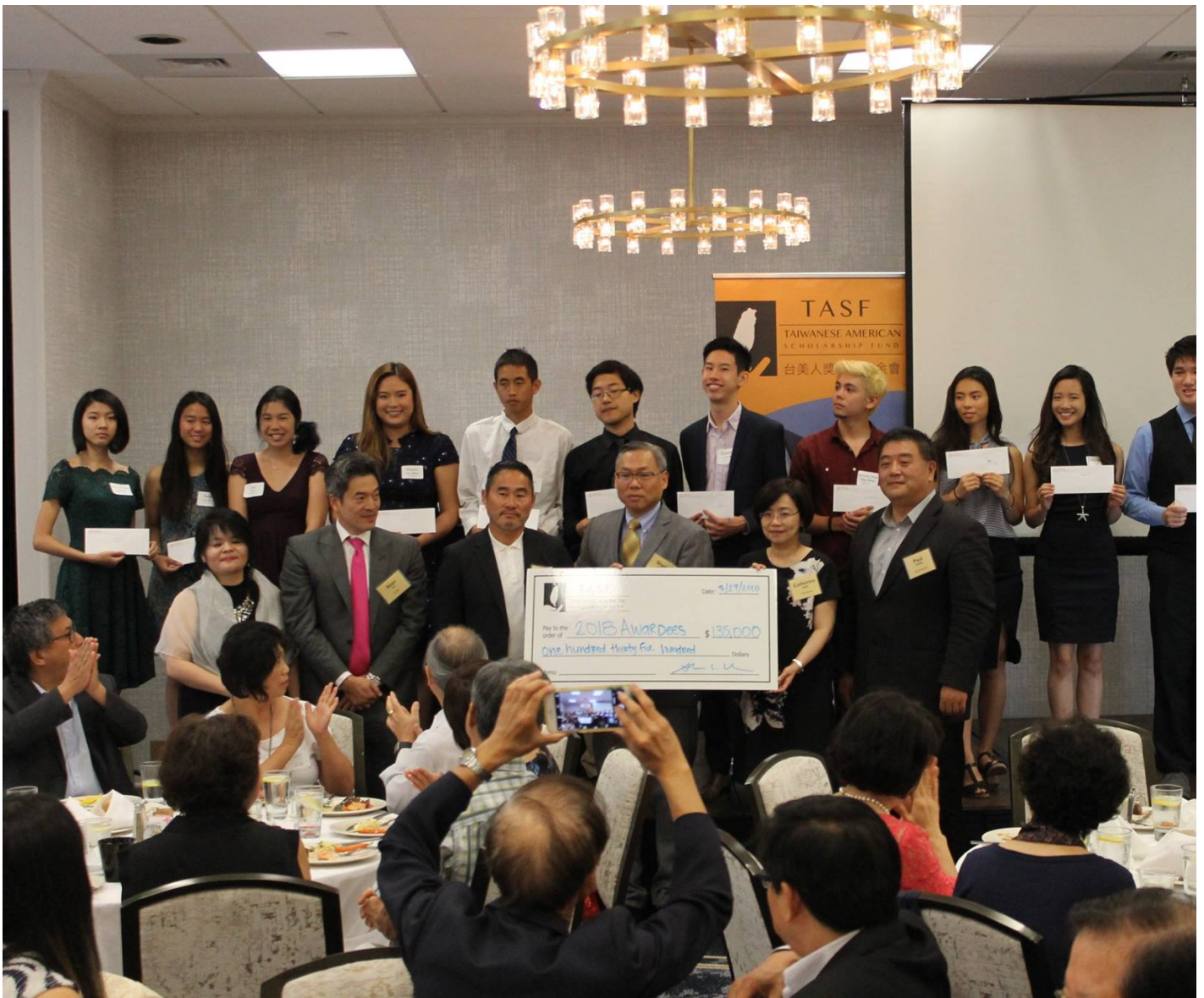
Scholarship winners at the TASF 2018 Awards Luncheon.

The Taiwanese American Scholarship Fund (TASF), the Cathay Bank Foundation, Royal Business E are offering scholarships for the fall of 2019. The deadline to apply for all scholarships listed here is 2019 at 11:59 p.m.