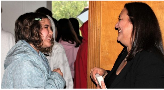
Renowned Educator Inspires Clifton Middle School Students